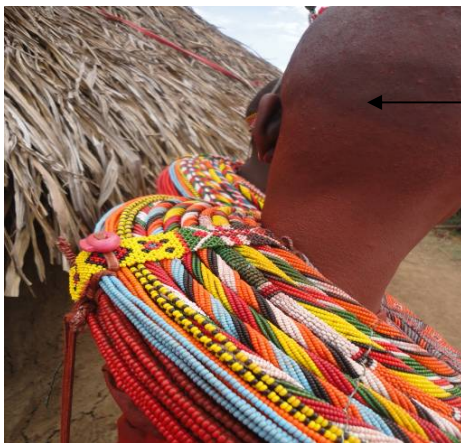
← Head clean shaved and painted with ochre

A mass of neck or shoulder beads, lchatata made from wired beads are worn. They are made by the girls, given by their married sisters or mothers. For the unmarried girls, red is dominant but married women mix red with black, white or blue. The beads are worn close to the neck, that they form neck rings to make the neck look longer and attractive. The neckrings are not flat like for the Maasai rather they form single loop neck rings that formed three to five bundles. It is from the field that the interviewed girls confessed to have worn lchatata as heavy as ten kilogrammes, and confessed to even sleep with them. 14 The hair is painted with red ochre or clean shaved to show off a massive of necklaces and earrings. The eyebrows are darkened with charcoal. A small compact mirror is important for the girl to keep painting her hair and face. 15 On the upper arm plastic bangles, lodii or metal bangles, lpankiii of different colours are worn for beauty. A girl may decide to wear a wired ring, lpete on all fingers or one or not. 16 See photograph below: