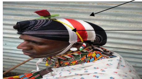
nankan e oroto